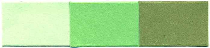
15. Verde * Green Trupocor STW Liq.