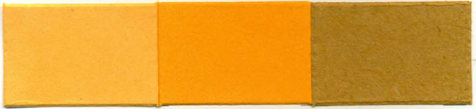
2. Amarillo * Yellow Trupobase GL liq.