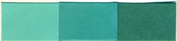
11. Verde * Green Trupobase G Liq.