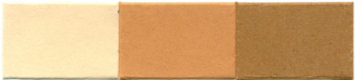
17. Pardo * Brown Trupocor 2GRF Liq.