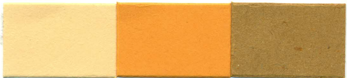
4. Naranja * Orange Trupocor E4GLAR liq.