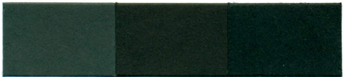
18. Negro * Black Trupocor SC Liq.