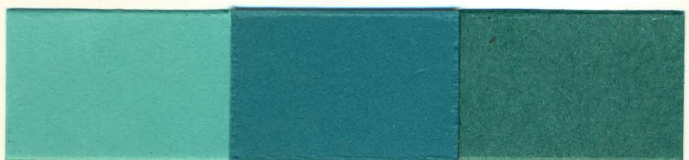
12. Verde * Green Trupobase WB Liq.