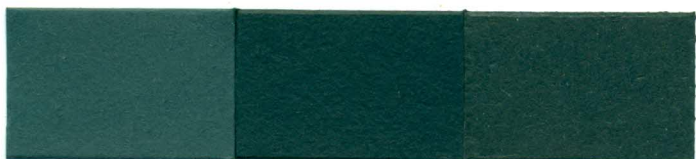
20. Negro * Black Trupocor CG Liq.