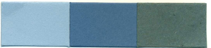
13. Azul * Blue Trupocor 2R Liq.