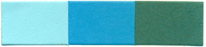
11. Turquesa * Turquoise Trupocor FBL Liq.