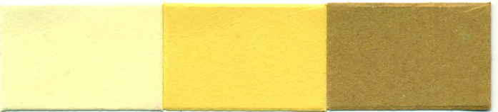
3. Amarillo * Yellow Trupocor F Liq.