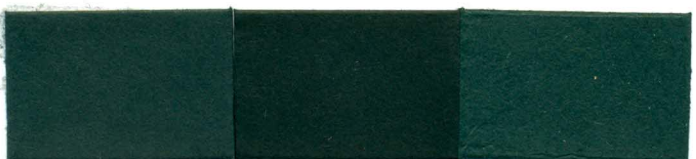
21. Negro * Black Trupocor RBF Liq.