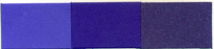
6. Violeta * Violet Trupobase 2BF Liq.