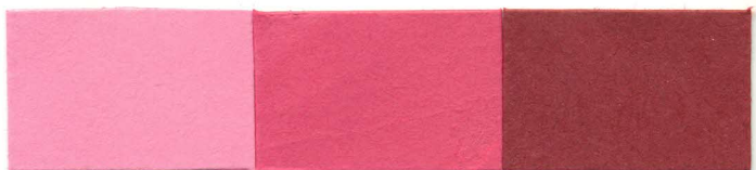
7. Rojo * Red Trupocor 8BLP liq.