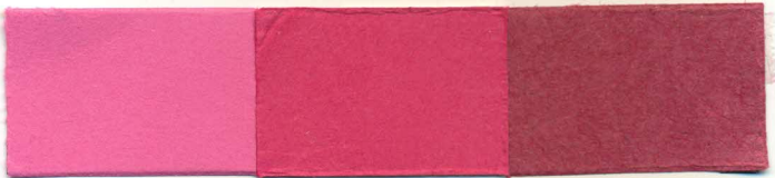
4. Rojo * Red Trupobase GRL Liq.