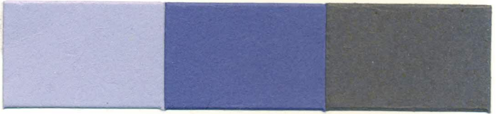
9. Violeta * Violet Trupocor LB Liq.