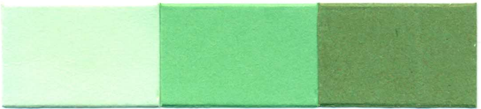
16. Verde * Green Trupocor VA Liq.