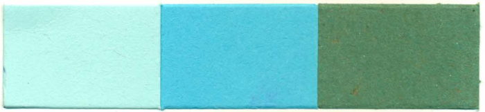
10. Turquesa * Turquoise Trupocor GE Liq.