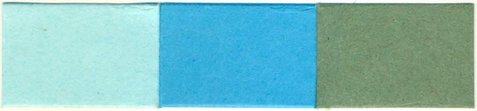
8. Turquesa * Turquoise Trupobase R-FB Liq.