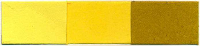
1. Amarillo * Yellow Trupobase AOB liq.