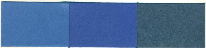
10. Azul * Blue Trupobase GRL Liq.