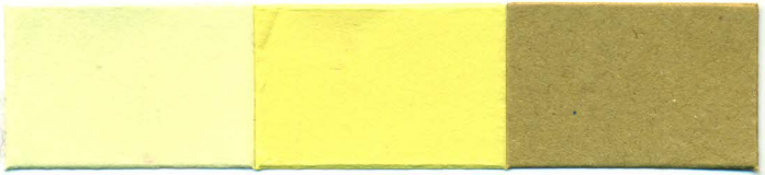
1. Amarillo * Yellow Trupocor R-DV liq.