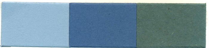
12. Azul * Blue Trupocor GDS Liq.