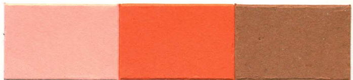
5. Naranja * Orange Trupocor R-ND liq.