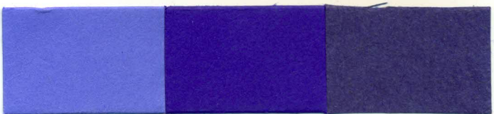
7. Violeta * Violet Trupobase 2BF-2B Liq.