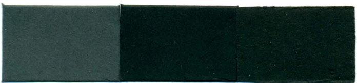
19. Negro sulfuroso * Sulphur Black GPD-NS Liq.