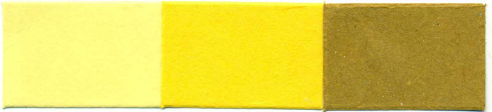
2. Amarillo * Yellow Trupocor R-DM Liq.