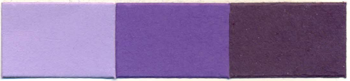
8. Violeta * Violet Trupocor FFB Liq.