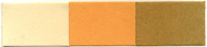
3. Naranja * Orange Trupobase GN Liq.