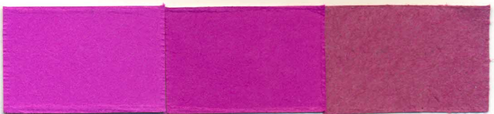
5. Rojo * Red Trupobase RB Liq.