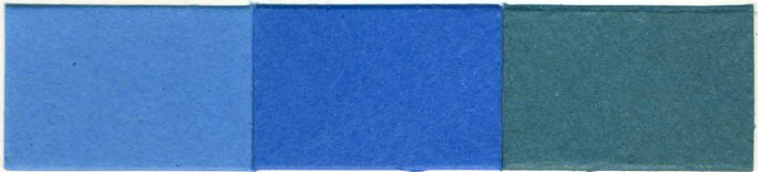
9. Azul * Blue Trupobase VBS Liq.