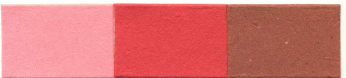
6. Escarlata * Scarlet Trupocor R-D2G liq.