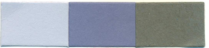
14. Azul * Blue Trupocor S2R Liq.